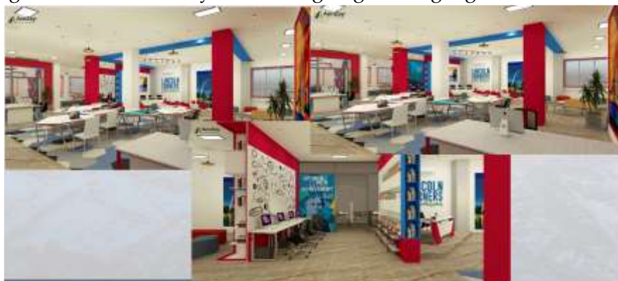
KIU Lincoln Corner at Main Campus