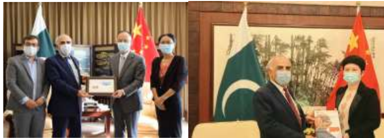
Vice Chancellor KIU receiving Shilelds from Ambassador PR China in Pakistan