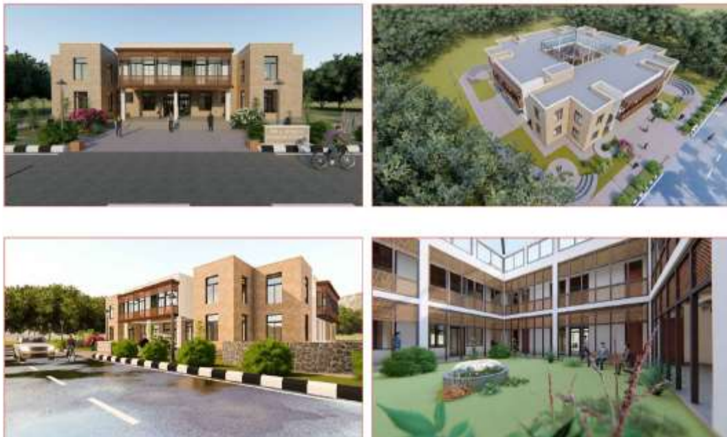
KIU Winter and Tourism Sports Academy

One of the 13 academies of Pakistan, where the youth from the county will be trained for winter sports such as Skiing, Ice Hockey, Snow rafting, Moutaineering, Wall climibing etc.