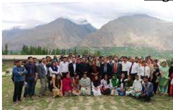
KIU Hunza Campus