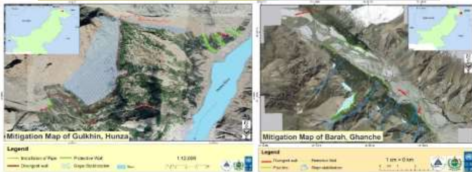
Some Climate related research and reports