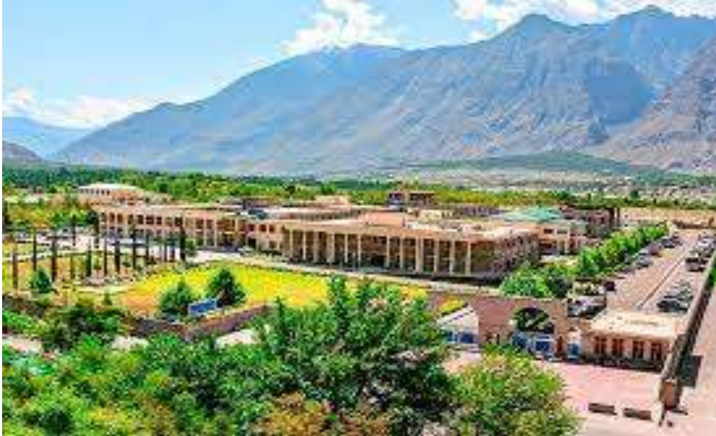
Main Campus Gilgit