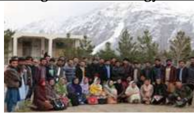
KIU Ghizer Campus