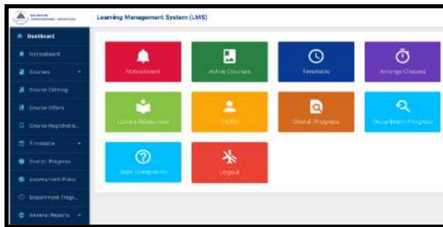
KIU Learning Management System (K-LMS)

Indigenously developed State of the Art Learning Management System of KIU covers the entire spectrum of education from registration to graduation