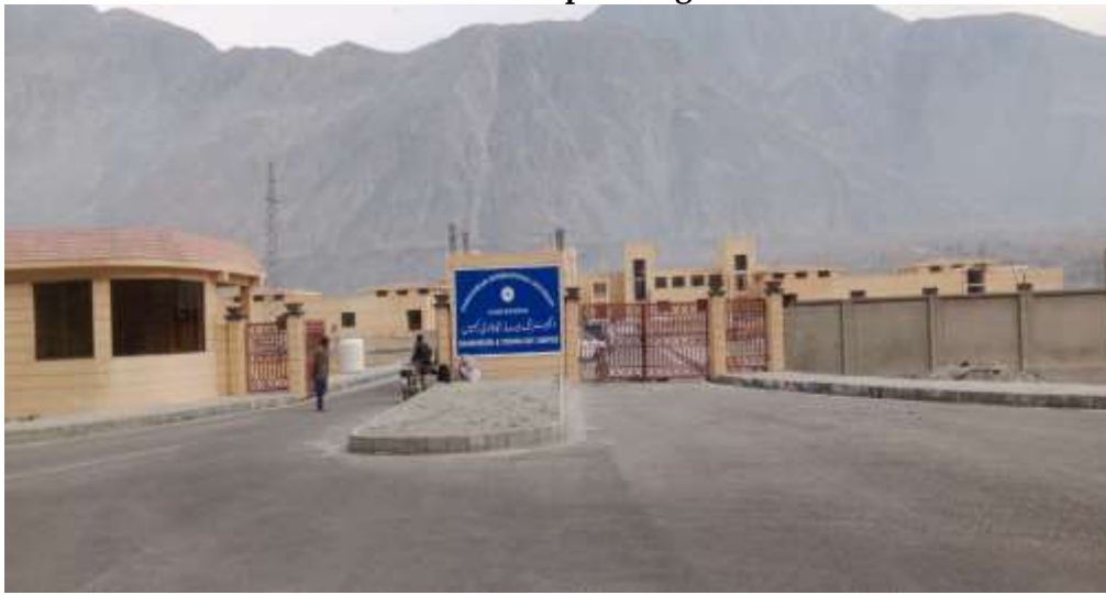
Engineering and Technology Campus Gilgit