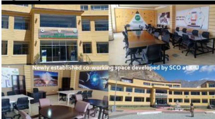
Pakistan Business Incubation Centre