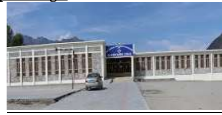
KIU Chilas Campus