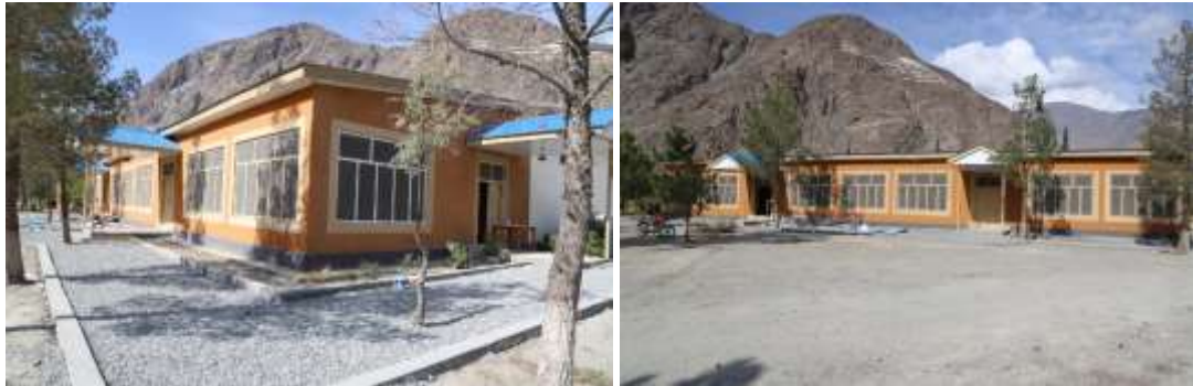
KIU Kamaya Jawan Markaz